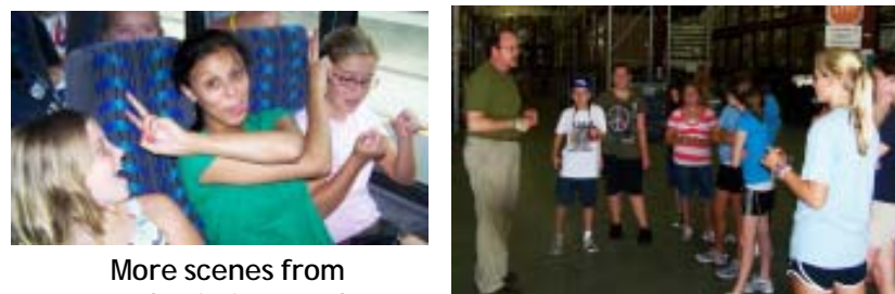
More scenes from Youth Mission Week!