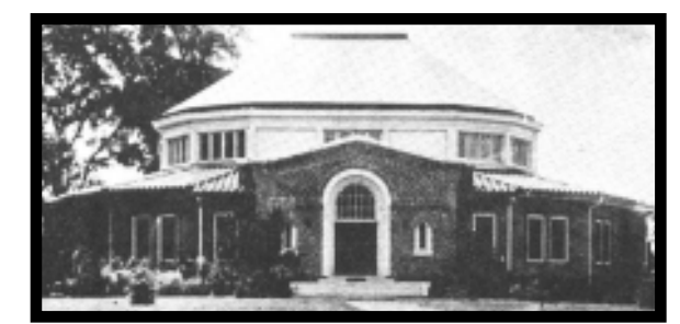
Highland Presbyterian Church - 1923